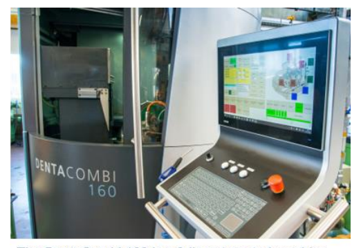
The DentaCombi 160 is a fully automated machine designed for multi-shift operation.

One further result of the co-engineering is the space-saving structure for the servo drive technology for the motion control. As the Denta Combi 160 is designed to be a compact machine, the room available for the installation is also correspondingly tight. "Connecting the motors using just one single cable is an enormous benefit for us as we only need to connect half the quantity", explains Christian van Rijs regarding the use of the AKW Washdown servo motors with single-cable connection technology. Four positioning drives, the high-frequency spindle for the grinding wheel as well as several measuring systems produce a "bunch of cables. If we are able to halve this number with the drive technology then we save space and can also be considerably more flexible."