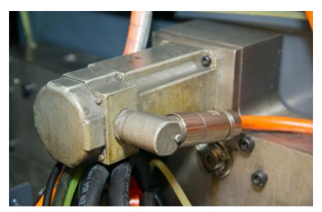
Motors from the AKM Washdown range position the grinding tool as robust units. Less space, less weight fewer installation masses need to be moved in the system thanks to the single-cable connection technology.

Van Rijs uses a high-pressure oil jet in the Denta Combi so that the teeth remain as cool as possible during chamfering. "Machines simply tolerate oil better than water. Cooling water has all kinds of additives in it which place a strain on the material and cause the machines to suffer." However, as water is more effective than oil in absorbing the friction heat during grinding, the machine engineer has to increase the pressure for the oil supply – and also to integrate a CO2 extinguisher into the system. In order to prevent the positioning drives inside the processing center from adverse damage through contact with the cooling liquid, the special-purpose machine builder from Gränichen in the Canton of Aargau uses specially coated synchronous servo motors from KOLLMORGEN – the AKM Washdown range with a coating made from a two component epoxy resin. This protects the light gray units securely from the impact of corrosive chemicals.